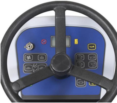
Control panel with icon buttons and modern display to reach best in class Ease of use