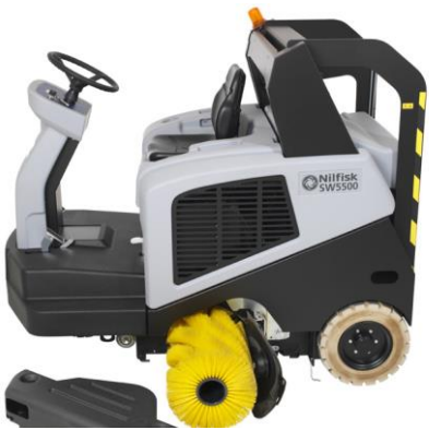
Fast and easy replacement of main components to make daily operations easy and reduce downtime